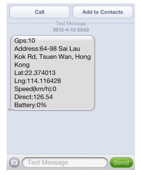
The SMS information sample is as follow:

Send SMS "LOCATE*123456" to the tracker, "LOCATE" is a command, "123456" is password. If the operation is success, the tracker will send back the information as above.