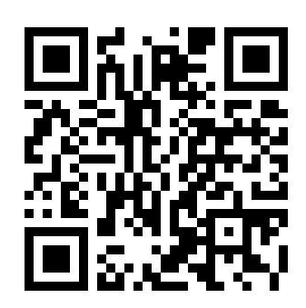
Platform User Guide Word Version